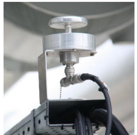
External noise sensor