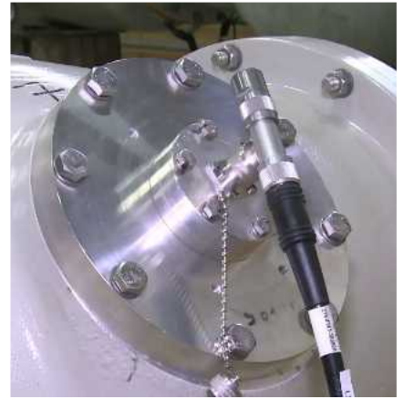
Internal PD sensor